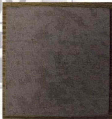
Figure 1b: Rough Surface